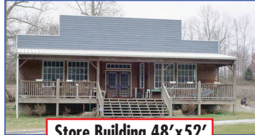
Store Building 48'x52'