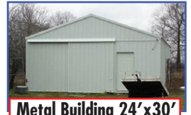
Metal Building 24'x30'